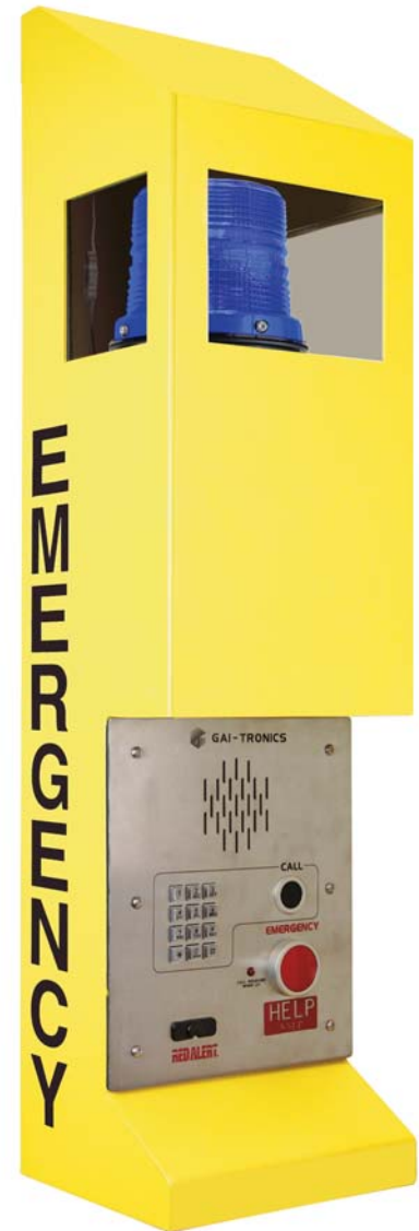
Model 234WM-202 (Model 398-00x series RED ALERT Telephone Shown Installed)

Note: Strobe and Telephone are purchased separately.