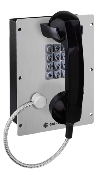
Model 276-002BH Analog Flush-mount Telephone with Keypad

GAI-Tronics' Flush-mount Behavioral Health Handset Telephones are available with either auto-dial or keypad functionality, in Analog or VoIP models. These telephones include a brushed stainless steel front panel with a painted dust cover to protect the conformal-coated electronics and are designed for indoor use. The design includes rounded corners and a standard 12-inch armored cord to assure the highest standard in guest, resident, and staff safety. The stainless steel pushbutton volume control provides quality audio for all environments and preferences.