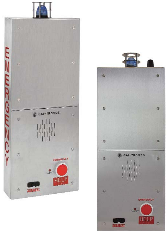
Model 239WM-001 (pictured left) and Model 239WM-002 (pictured right) Slim Wall-mount Communication Station with Model 397-001 Emergency Telephone (sold separately)

GAI-TRONICS' Model 239WM-00x Series Slim Wall-mount Communication Station provide an aesthetically appealing package for our RED ALERT® Emergency Telephones. The wall-mount communication station includes a blue LED strobe with a constant-on feature for telephone location identification. The strobe will flash when the emergency telephone has been activated, providing ease of location for first responders.