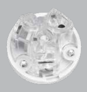
Transparent terminal cover, extended "teardrop" wiring pockets and backed out "captive" terminal screws simplify wiring.