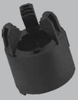
Internal "self-centering" Triple Gripper® cord grip with "radius teeth" design provides secure cord retention.