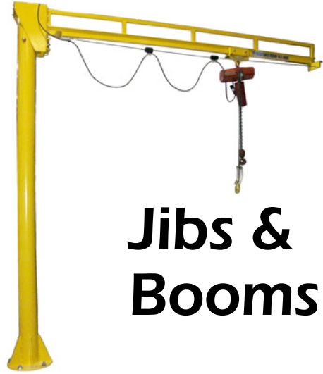
Jibs & Booms