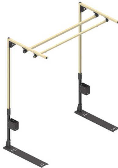
Work Bench Kits