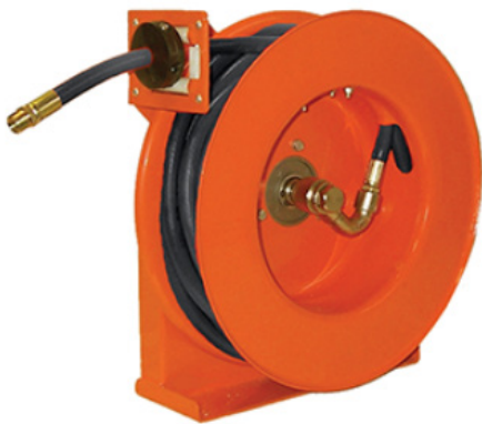
Cord & Hose Reels