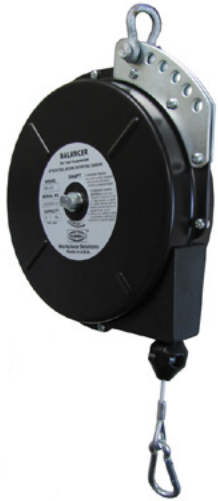
ERGO™ Tool Balancers