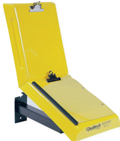
WALL MOUNTED DOCUMENT STAND