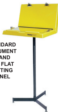
STANDARD DOCUMENT STAND with FLAT WRITING PANEL