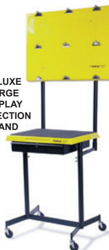
DELUXE LARGE DISPLAY INSPECTION STAND