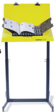
CATALOG DISPLAY STAND