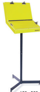
13"x 20" DOCUMENT STAND