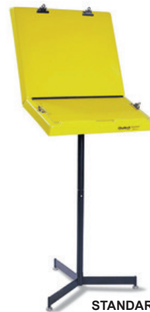
STANDARD "C" SIZE DOCUMENT STAND