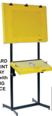
STANDARD BLUEPRINT DISPLAY STAND with WRITING SURFACE