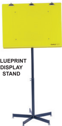
BLUEPRINT DISPLAY STAND