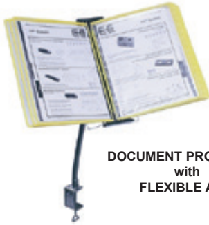
DOCUMENT PROTECTOR with FLEXIBLE ARM