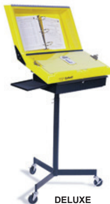
DELUXE INFORMATION STAND