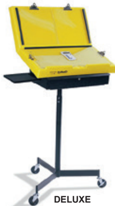
DELUXE 13"x 26" DOCUMENT STAND