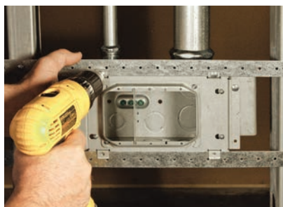
Accepts Connectors up to 2" and Spanner Mounting Straps