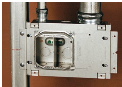
For Combination Power, AV, and Data applications