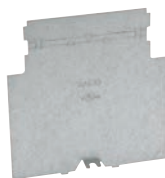
UL Listed Voltage Partition