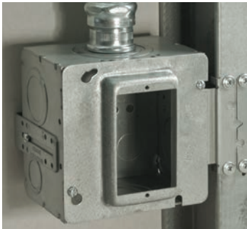
Use standard 4-11/16" covers and large KO for data outlet applications