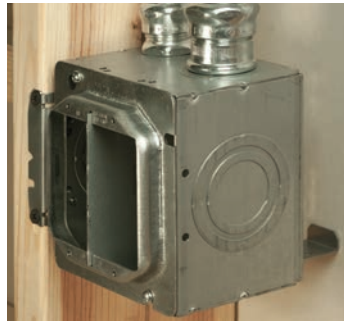
Use standard 4-11/16" sq. covers and 981 partition for power and data in same box