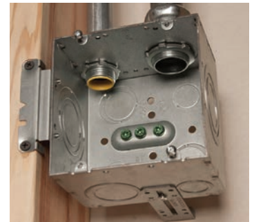
Mount box and run conduit before mud ring is attached