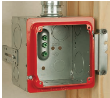
Use with adapter ring for professional looking installation of fire alarm notification appliances