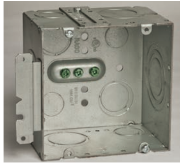
Far-side support adjusted and bracket installed