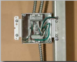
Ideal for PREFAB Applications