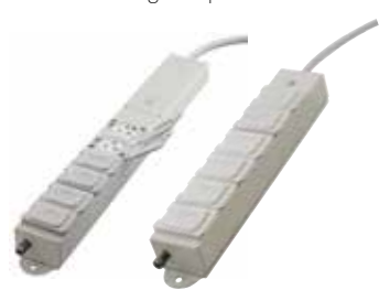
Healthcare Outlet Assembly (HCOA)