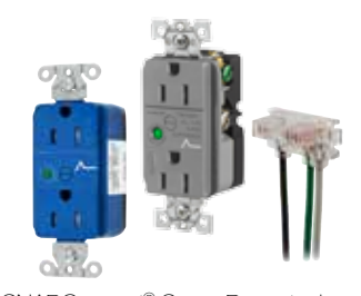
\mathsf{SNAP}\mathit{Connect}^{\scriptscriptstyle{(\!R\!)}} Surge Receptacles