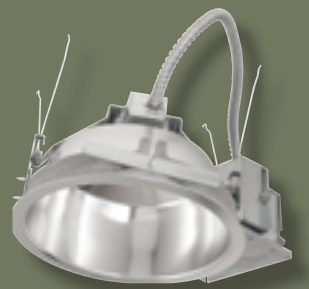
Prescolite | RLC8LED 8" LED Retrofit Downlight

Connect with us through social media and join the conversation! RSS | LINKEDIN | TWITTER | FACEBOOK | YOUTUBE