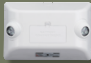
Dual-Lite | EVHC-BC High Lumen LED Emergency w/ Front-Side Battery Compartment