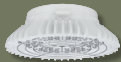
Hubbell Industrial | HBLHA High Ambient LED Highbay Up to 65°C