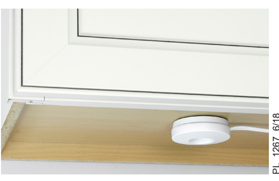
Sleek, low-profile design.

Use direct wire connectors and cable to link more than one LED puck undercabinet fixture.