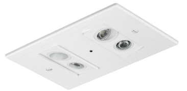
WAYSTAR™ - PECEM-31-SD RECTANGLE & ROUND TRIMS INCLUDED