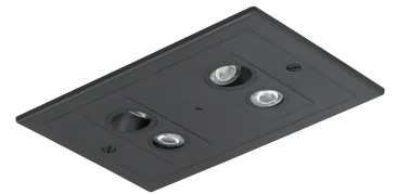
WAYSTAR™ - PECEM-30 RECTANGLE & ROUND TRIMS INCLUDED