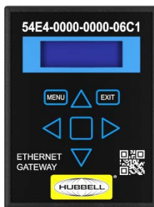
Figure 1: Ethernet Gateway