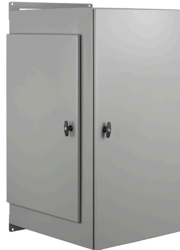
Equipment slides out on industrial strength brackets for easy access