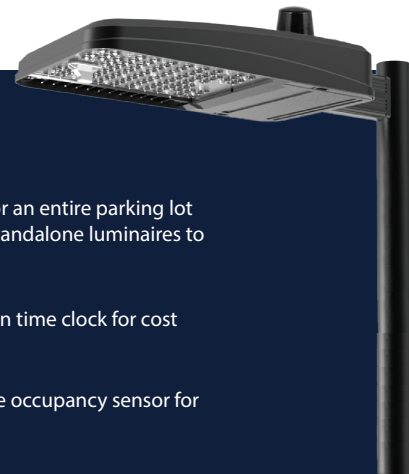
Beacon Viper from Hubbell Lighting