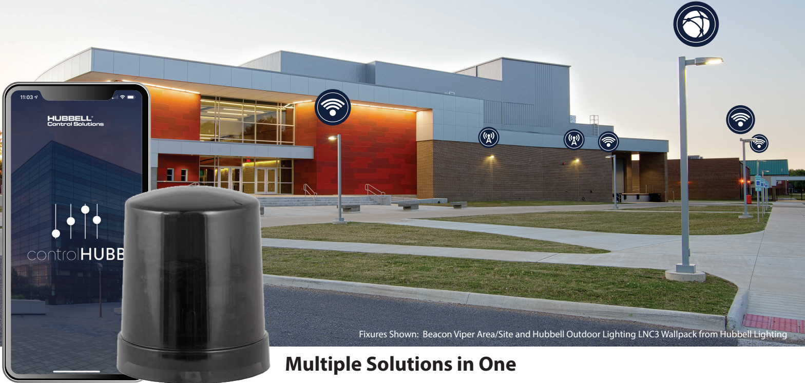
Fixtures Shown: Beacon Viper Area/Site and Hubbell Outdoor Lighting LNC3 Wallpack from Hubbell Lighting