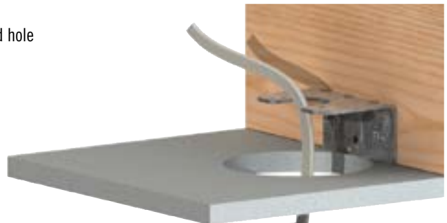
Old Work or Engineered Joists