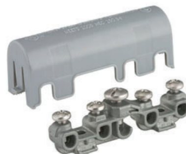
For Solid or Stranded Conductors RACO RACIBB