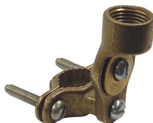
For 1/2" and 3/4" Rigid Conduit RACO 2512, 2522, and 2513