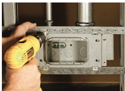
Accepts Connectors up to 2" and Spanner Mounting Straps