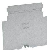
UL Listed Voltage Partition