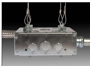
Grand Slam Box installed with 991 Box Hanger