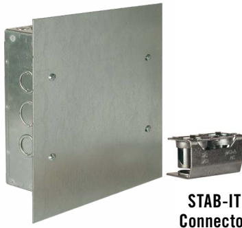
Flush Mount Cover (sold separately)