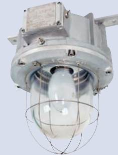
The 238 with wire guard

The 238 is a powerful and efficient wellglass that is designed for general purpose low and medium bay illumination. The luminaire has a side mounted increased safety terminal chamber eliminating the need for flameproof glands.