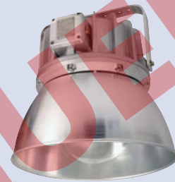
The 261 with external reflector