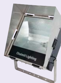
The 864 with anti-glare shield

The 800 series is a range of stainless steel asymmetrical floodlights. These floods are designed for optimum light output and efficiency to ensure the minimum number of luminaires is required.