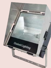
The 864 with anti-glare shield

The 800 series is a range of stainless steel asymmetrical floodlights. These floods are designed for optimum light output and efficiency to ensure the minimum number of luminaires is required.