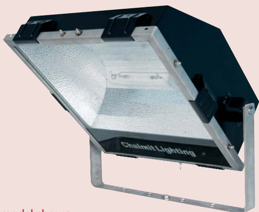
864 Ex n model shown (As standard all industrial 864, 854 & 844 models have stainless steel finish)

Recommended maximum aiming angle 20° from horizontal plane