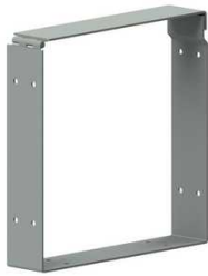
* Representative image