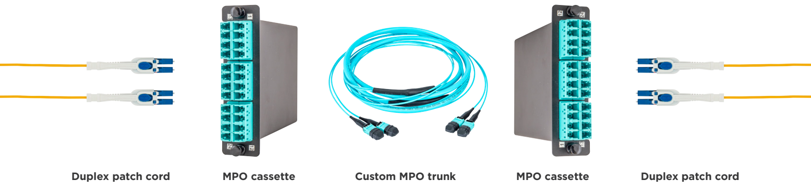
Duplex patch cord