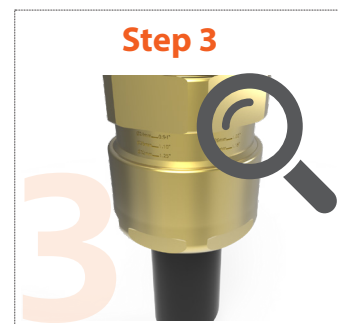
The backnut should be level with the marking guide corresponding to its diameter – this can be visually inspected and adjusted as necessary

Note: The cable gland installation instructions have a printed cable OD measure for if the cable OD is not known