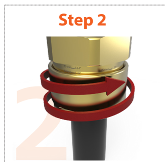
Tighten backnut until a seal is formed onto the cable, then tighten one further turn