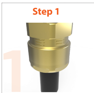
Follow cable gland installation instructions until final stage – tightening of rear seal

The gland is permanently marked with various lines/numbers indicating the correct tightening level related to the cable diameter. Following the relevant cable gland Installation Instructions, the back seal should be tightened until a seal is formed on the cable outer sheath and then tightened one further turn.