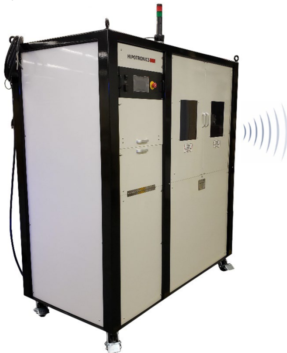
100kV unit (pictured above) Example of oil bath & test cell (pictured below)

The D149-DI Series of AC Dielectric Breakdown Testers represents a new level of sophistication, flexibility and accuracy in breakdown voltage testing. Each unit is equipped with a new standard embedded firmware controller that is internally programmed to perform the ASTM D149 short-time test, step-by-step test and slow rate-of-rise test as well as the tests procedures in the IEC60243-1 and IEC60243-2. This unit can also be easily programmed to perform variations of these test sequences. The voltmeter circuit continually samples each waveform to determine the breakdown voltage with the highest accuracy. The operator can control all test parameters as required. When testing is complete, all breakdown information for that series of test samples are automatically recorded. Standard units are available in 30kV, 50kV, 75kV and 100kV AC/DC for a wide variety of applications.