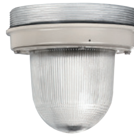
Replacement Globe & Support Assemblies