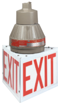
Exit Sign Accessory