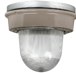
Replacement Globe & Support Assemblies