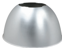
HRD400 HRD400ALZ (pictured)