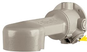
HIC-BEIGE replacement wiring plug for EZBx Wall Bracket