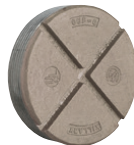
Ezcup Close up plug for EZ mounting boxes. Used for maintenance when fixture is removed for service.