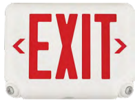
EVC Combo Exit/ Light