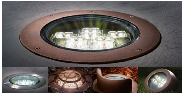
Lightvault8 Flat Frame, Stainless Steel, Rock Guard, Half Shield, Eyeball