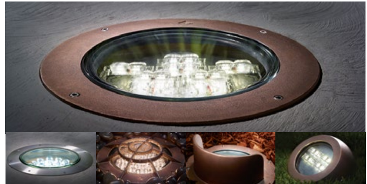
Lightvault8 Flat Frame, Stainless Steel, Rock Guard, Half Shield, Eyeball