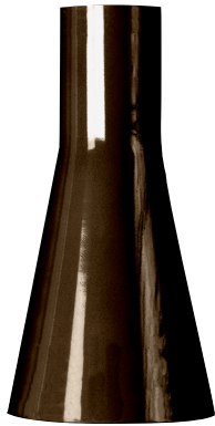
DB Dark Bronze