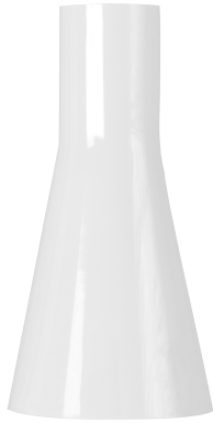
WM White Metallic