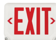
EVC Combo Exit/ Light