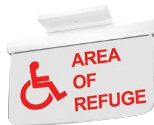
Special Wording Option